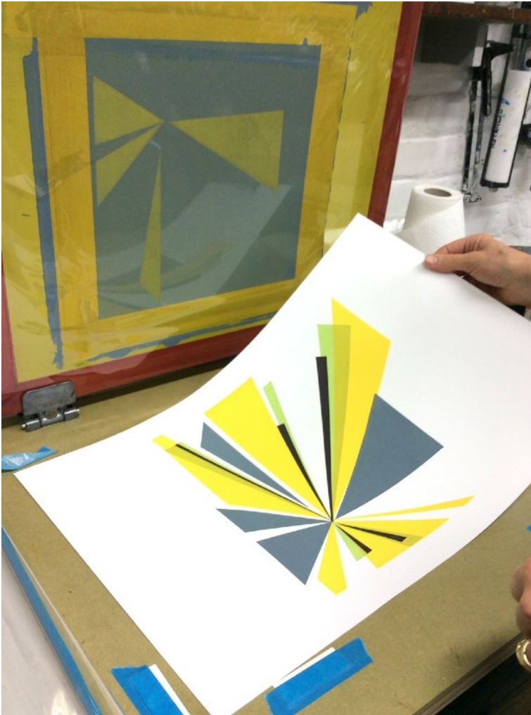
Bernie Grist has overlaid some cut stencils with transparent ink (work in progress)